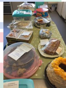
The Bake Off