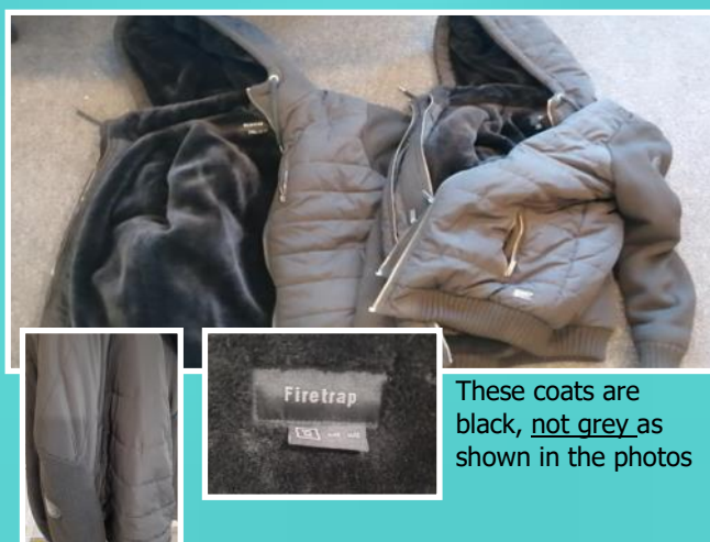
These coats are black, not grey as shown in the photos

If your child has lost any of the items shown above or anything else, please click on the link here to report lost property or email us directly reception@bexleygs.co.uk .