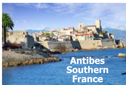
Antibes Southern France