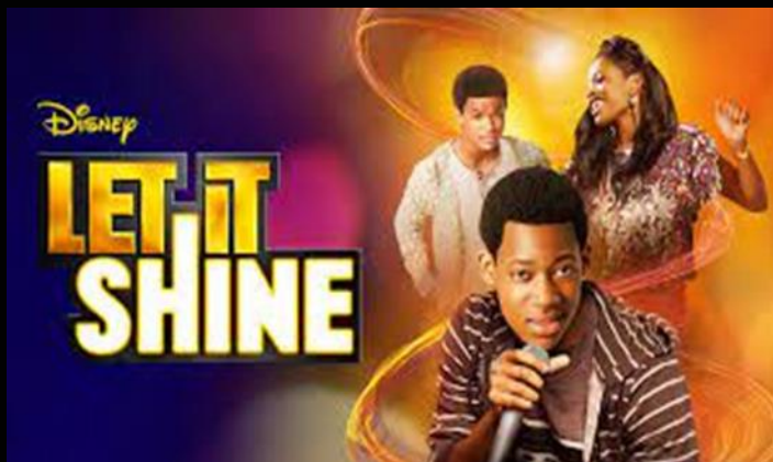
Tuesday 19th October Let it Shine