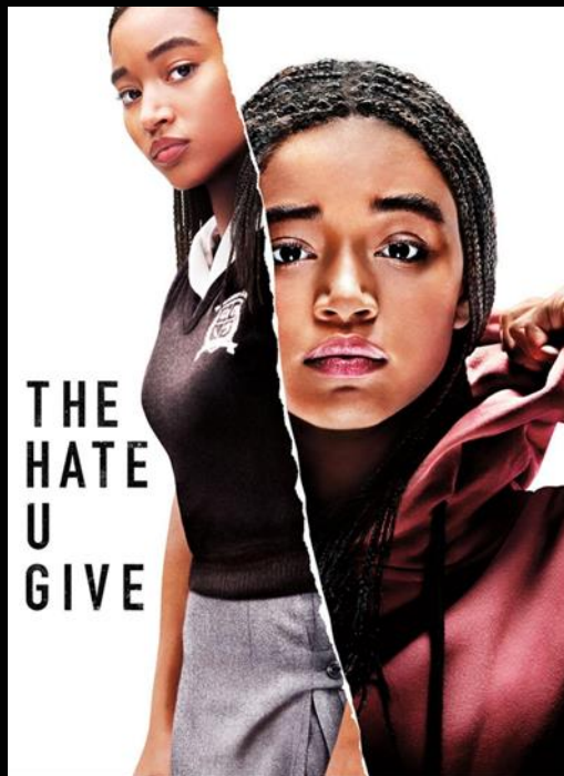
Tuesday 5th October The Hate U Give

Afro-Caribbean Society will be screening movies each week in K10 from 3:20 pm.