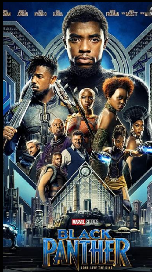
Tuesday 12th October Black Panther