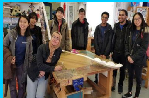
Stem Ambassadors UCL