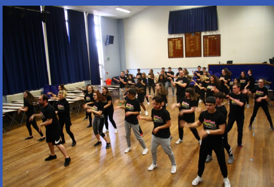
Warming up in the hall!